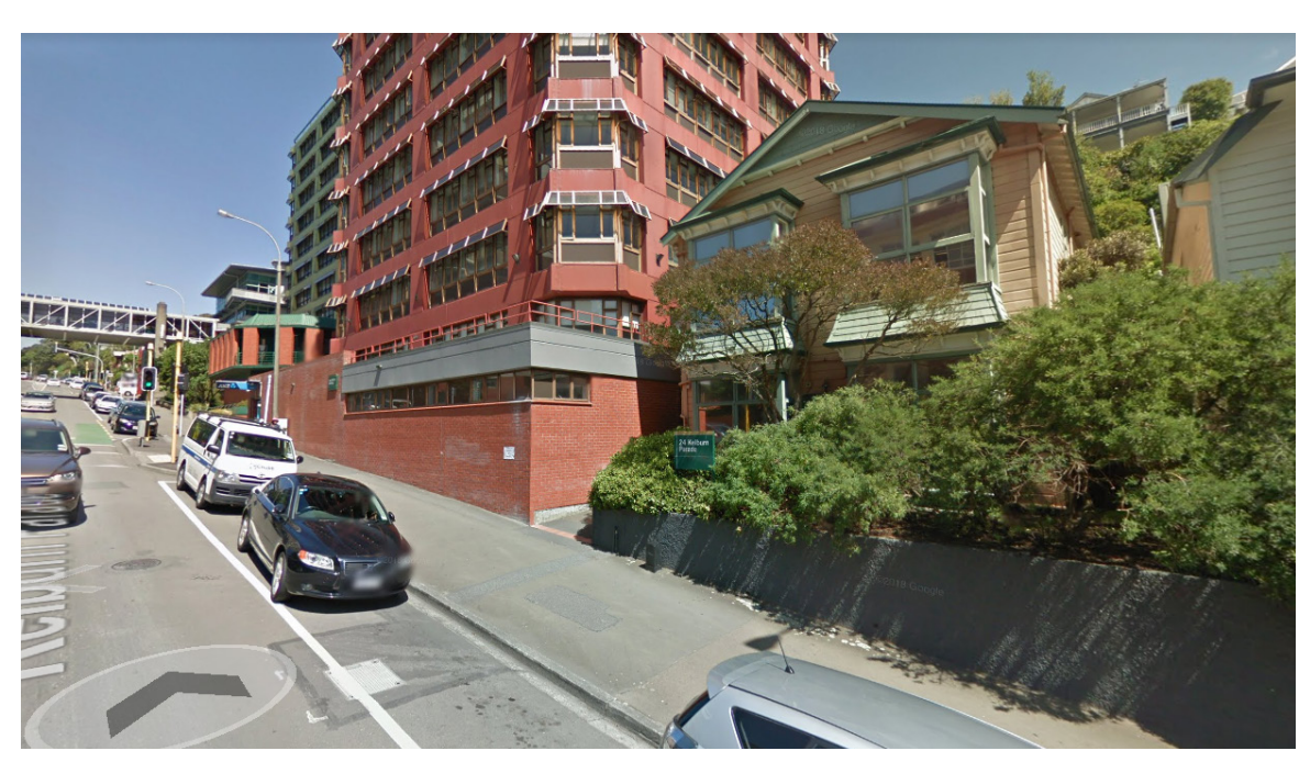
Fire Evacuation Assembly Point (for 24 Kelburn Parade, von Zedlitz & Murphy Buildings)