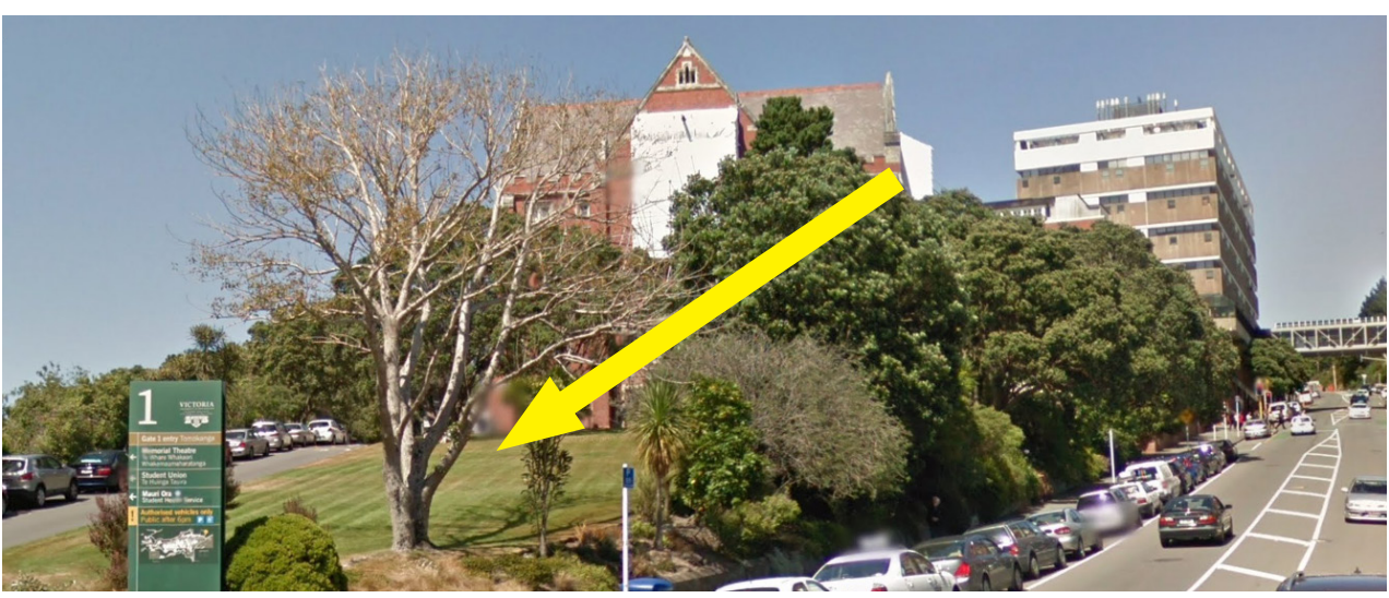
Earthquake Evacuation Assembly Point